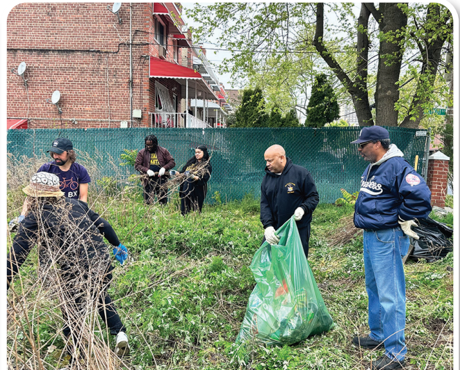
Assemblyman Heastie and Team Heastie participate in a community clean-up