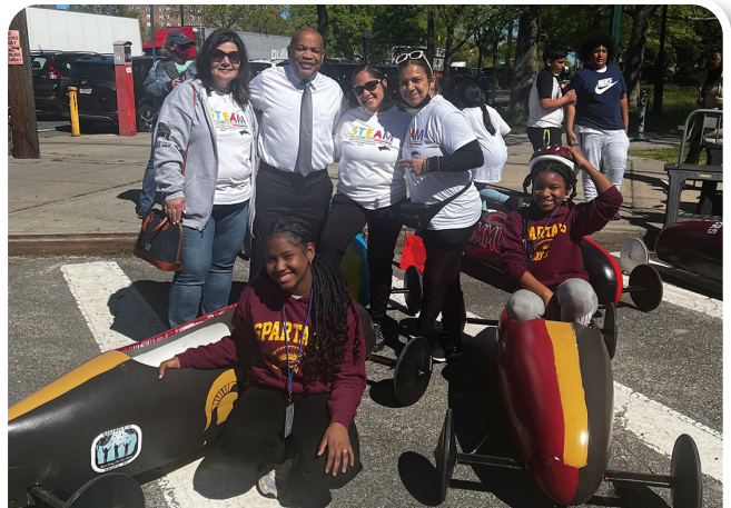
District 11's Annual SoapBox Derby with Middle School 144