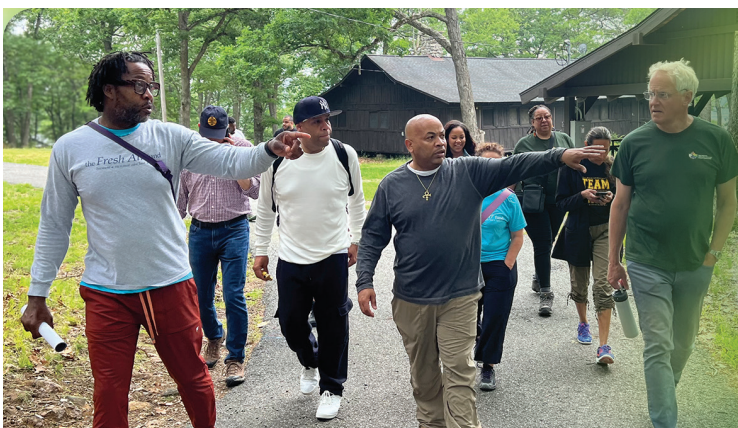
Team Heastie Attended Camp Junior's Clean Up Day to prepare for the influx of children this summer

"From investing in community programs to protecting our neighborhoods, this year's legislative accomplishments will allow the Northeast Bronx to prosper by bringing much-needed resources home."