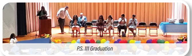
P.S. 111 Graduation

This program offers an opportunity for young adults to have hands-on experience with shared cultural arts and activities. The programs are conducted year-round to help keep young adults off the street and engaged in quality cultural enrichment.