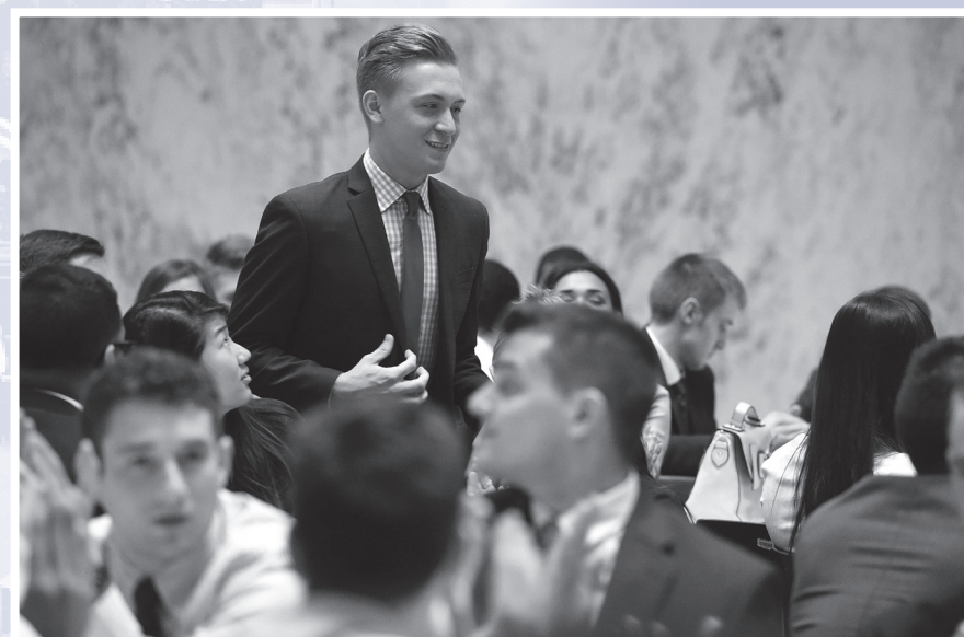
2015 Award Ceremony