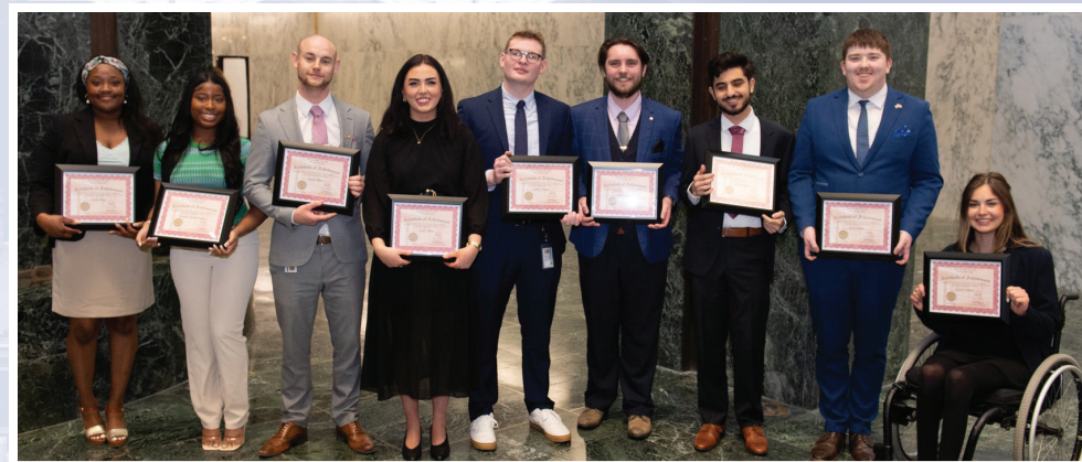
2023 Session Internship Research Paper Award Winners