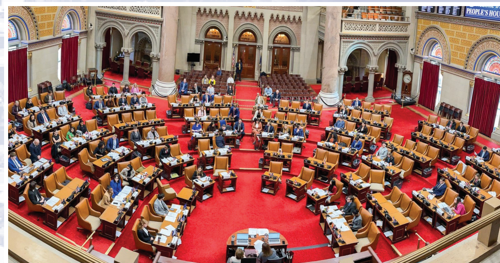
2023 Mock Session