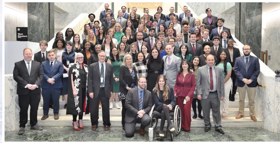
2023 Session Internship Class

The practicum will familiarize students with the practices of public policy-making as experienced in a legislative office, and prepare students to participate in the policy-making process through professional skills development and preparation of a professional portfolio of written work or documentation produced or used in legislative offices. Students will review and ultimately produce some of the more common types, such as bill and sponsor memos, public hearing testimony, and letters seeking to influence policy-making. All students will be asked to participate in and prepare materials for a "mock" public hearing to be conducted in mid-February.