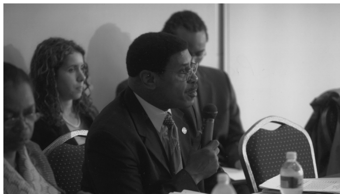
Assemblyman Scarborough and Senator Velmanette Montgomery held a hearing at Borough of Manhattan Community College on the city's plan to force 5 year-olds out of day care centers and into public schools.