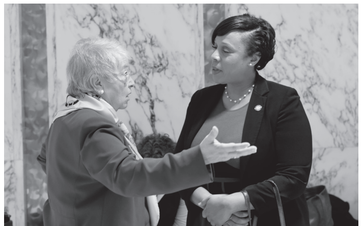
Speaking with New York City Department of Education Chancellor Carmen Farina about improving our schools.