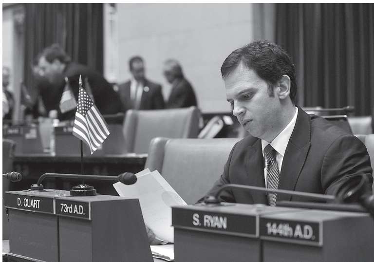
Assemblymember Quart in the Assembly chamber.

owners. A new mayor offers a new opportunity to finally reform our property tax system. I look forward to partnering with the mayor to achieve this important goal. At the same time, I will continue to work to pass my legislation increasing the transparency in our property tax system.