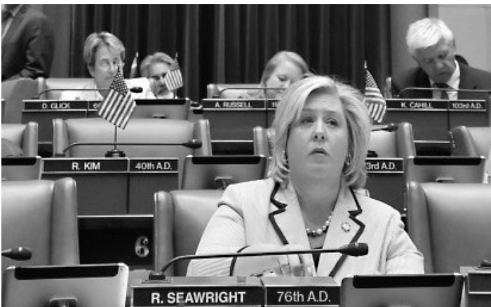
Assembly Member Seawright, the prime sponsor of legislation that confirms RIOC's ability to distribute Public Purpose Funds, argues in support of bill. An overwhelming majority of the Assembly Member's colleagues voted in favor of the bill, which is now awaiting the Governor's signature.

Additionally, the New York City Rent Guidelines Board approved the City's first ever rent freeze. For a one-year renewal lease with a start date between October 1, 2015 and on or before September 30, 2016 there is a 0.0% rent increase. For a two-year renewal lease with a start date between October 1, 2015 and on or before September 30, 2016 there is a 2.0% rent increase. Tenants with leases that must be renewed prior to October 1, 2015 may choose between a one-year renewal lease increase of 1.0% and a two-year renewal lease increase of 2.75%.