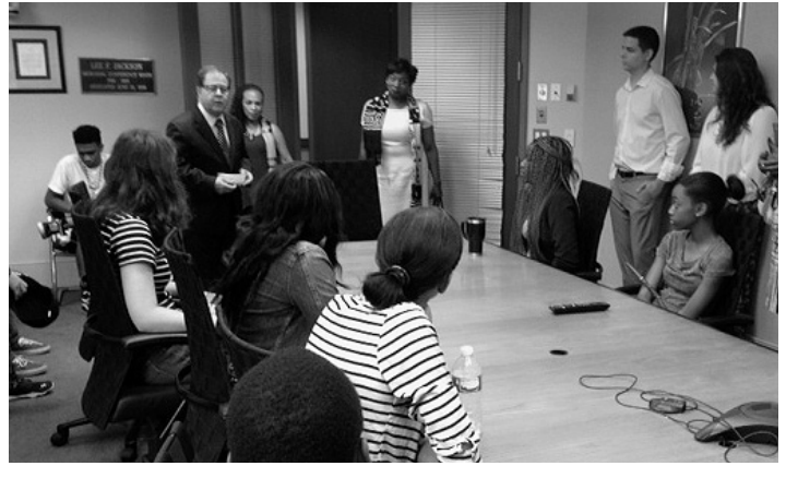
Assemblyman Abinanti meeting with summer interns at Greenburgh Town Hall.