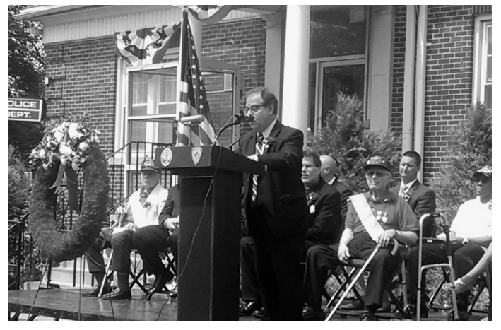
Assemblyman Abinanti spoke at the Elmsford Memorial Day celebration.