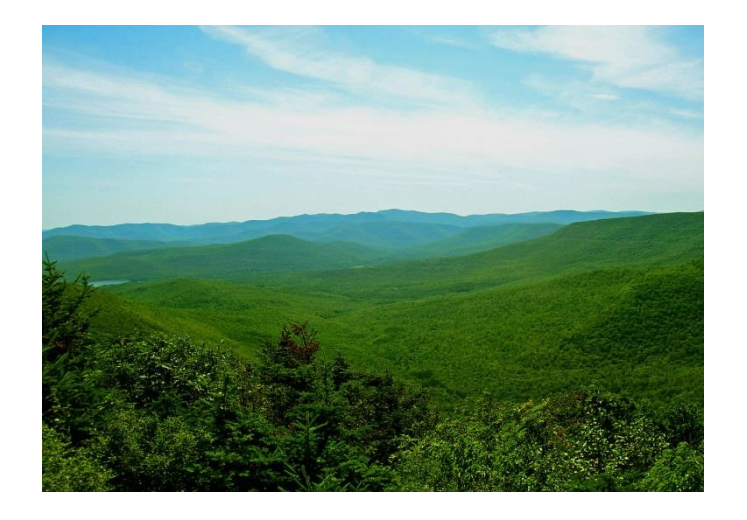
The communities of Ulster, Hurley, Olive, Woodstock and Shandaken will all have the opportunity to experience the positive attributions offered by the amendment.

This constitutional amendment strikes the delicate balance necessary for the Catskills to preserve the water, soil and air while enhancing public safety for the people who live there as well as for those who want to visit.