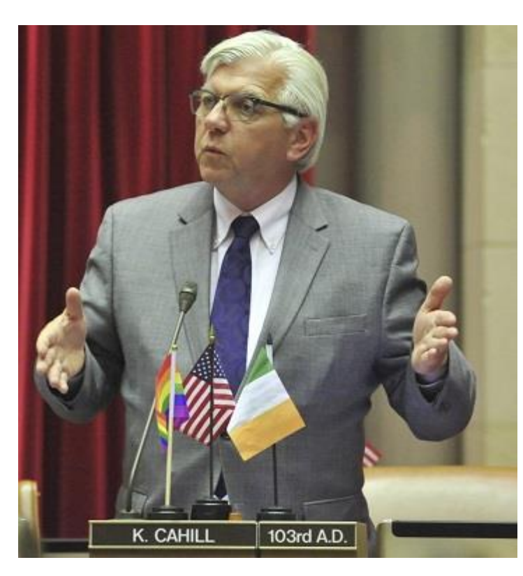
The standards established by this legislation are reasonable when one considers the long-term effects of energy production and usage.

The measure passed by the Assembly reaffirms New York's leadership in protecting our planet. Across the 103<sup>rd</sup> Assembly District there are countless regional treasures. Whether it is the historic Hudson River, the Gunks, the bucolic character and open space of Ulster and Dutchess Counties or our gorgeous Catskills, we need to be proactive in working to ensure that these areas can be cherished by future generations.