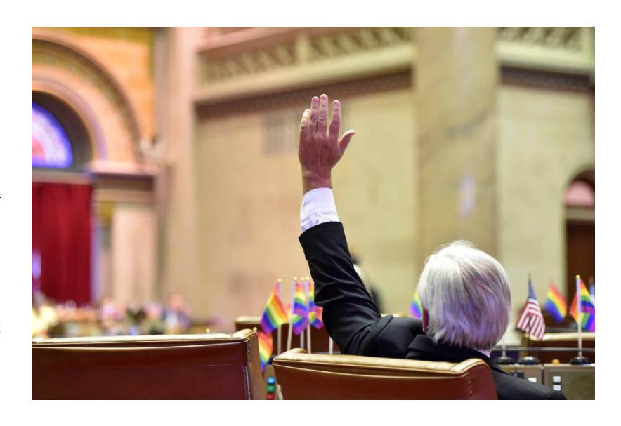
Municipal officials must have a clear picture of the level of anticipated sales tax revenue in order to effectively plan.

Unfortunately, the Senate failed to pass this bill. The Legislature was ultimately successful in reforming the process during this year's budget. Provisions were agreed to that allow the New York State Tax Department to send out STAR checks with an estimated amount, thus reaching mailboxes more quickly. The new law requires the State to deliver the checks 30 days after their school district files their tax rolls with the State. If the refund comes late, the Tax Department will be forced to pay about three percent interest to the taxpayer.