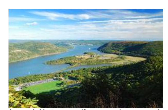
The renewal of the Greenway reaffirms our commitment to protecting open space and green space and further facilitates community development in the Hudson Valley.

In addition, I lead the effort to renew the Hudson River Greenway. I sponsored legislation in the Assembly and then the New York State Senate passed legislation continuing the Hudson River Greenway. This assures that localities are indemnified for their participation for the next five years. The Greenway promotes the preservation of our natural resources and environmental treasures in the local region. The indemnity clause has been the key in getting every municipality in the Hudson Valley to sign on to the Greenway Compact, one of the greatest accomplishments in the State's environmental legacy.