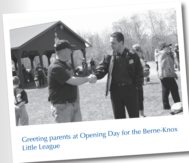
Greeting parents at Opening Day for the Berne-Knox Little League