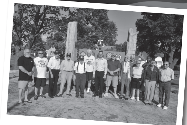
Thanking local veterans for their service