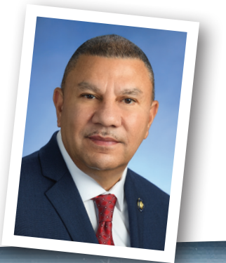
Phil Ramos Member of Assembly

District Office 1010 Suffolk Avenue Brentwood, NY 11717 631-435-3214