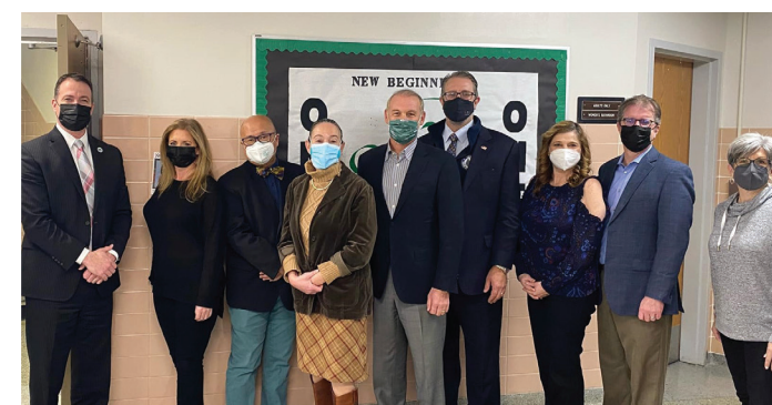
With members of the Harborfields Board of Education to hear and discuss community concerns at the annual legislative breakfast.