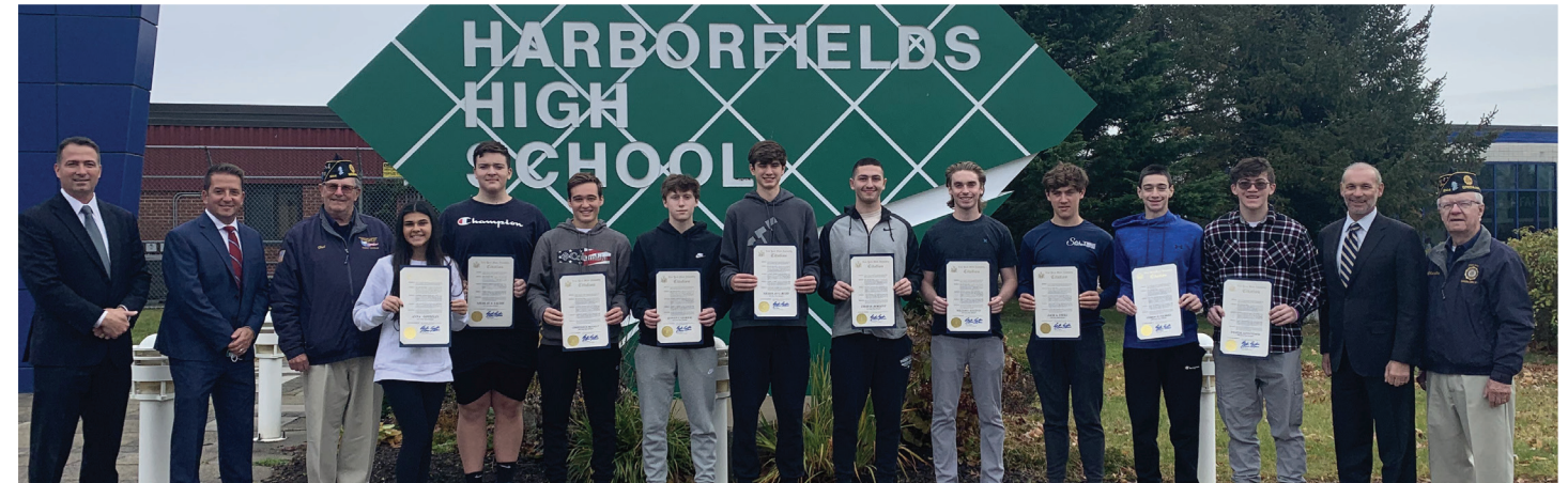
Proud to support the Boys' and Girls' State Program and our leaders of tomorrow.