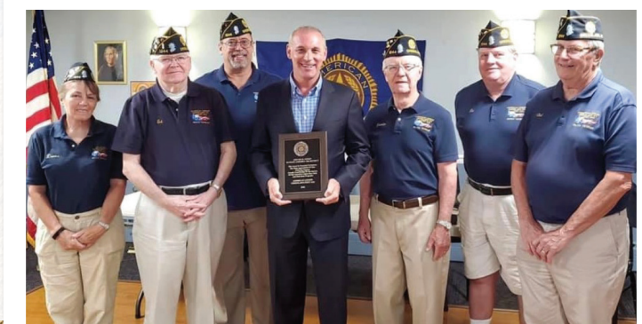
Proud to be honored by the Greenlawn American Legion Post #1244 for my strong support of our veterans.