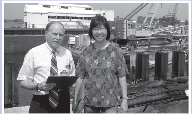
Assemblyman Colton has set up an Anti-Waste Task Force, Co-Chaired by Charles Ragusa and Nancy Tong, to document and expose the dangerous actions by the City on the construction site. Colton recruited Neighborhood Watch volunteers to photograph the unsafe conditions at the site.