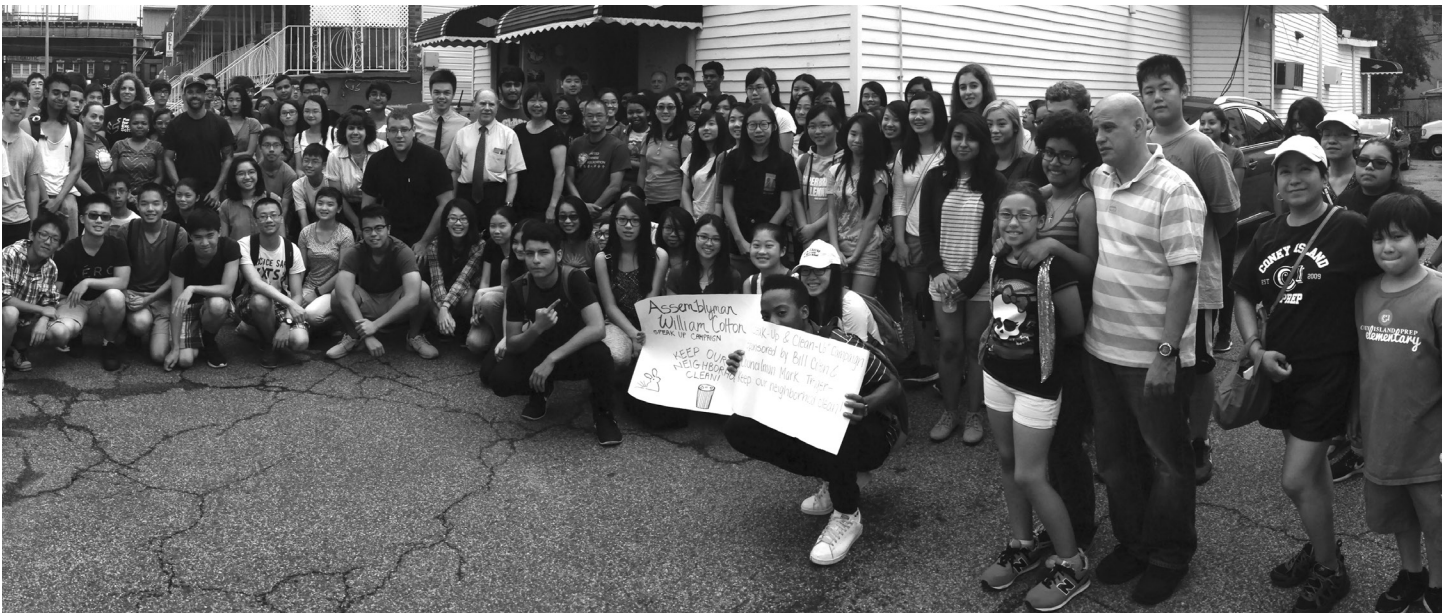
Photo showing one of COLTON'S recent famous CLEAN UPS which attract hundreds of neighborhood youths to clean up our streets.

These new street sweeping services are in addition to Colton's Speak Up and Clean Up campaigns where Assemblyman Colton has been motivating hundreds of high school volunteers to clean up some of our dirtiest streets. These young volunteers not only pick up garbage but also educate family, friends, and neighbors of the need to keep our streets clean.