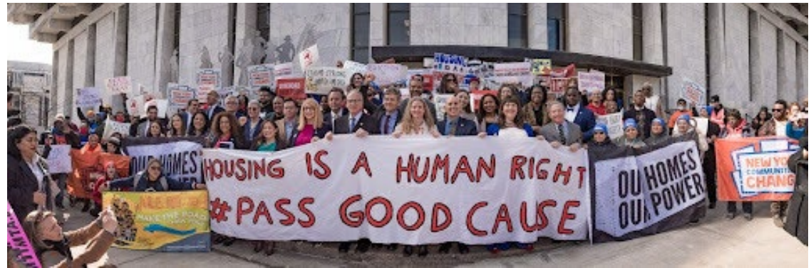
Rallying in Albany with hundreds of tenants and colleagues to pass Good Cause Eviction.

I have fought hard to pass Good Cause Eviction legislation which will ban the monstrous rent increases so many of us have seen in recent years. Keeping tenants stable in their homes means stronger communities, healthy families and less homelessness.