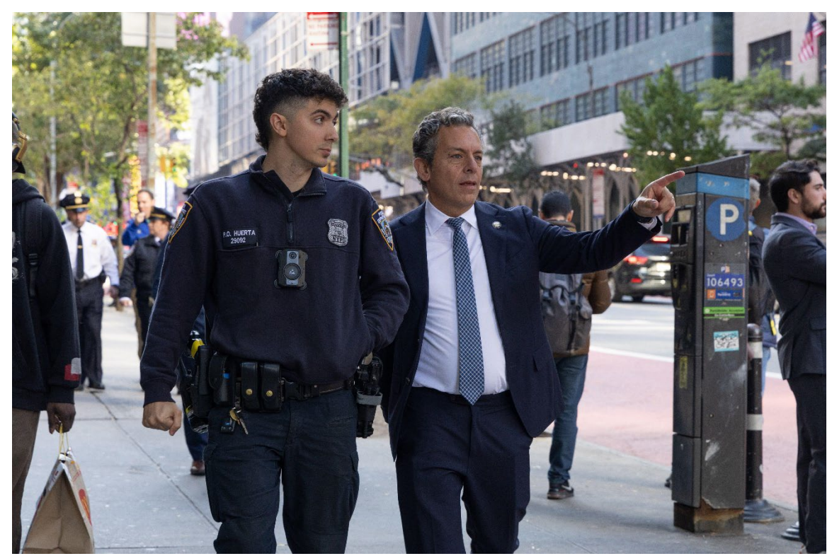
Walking West 42nd Street with the NYPD during a public safety walkthrough organized by my office.