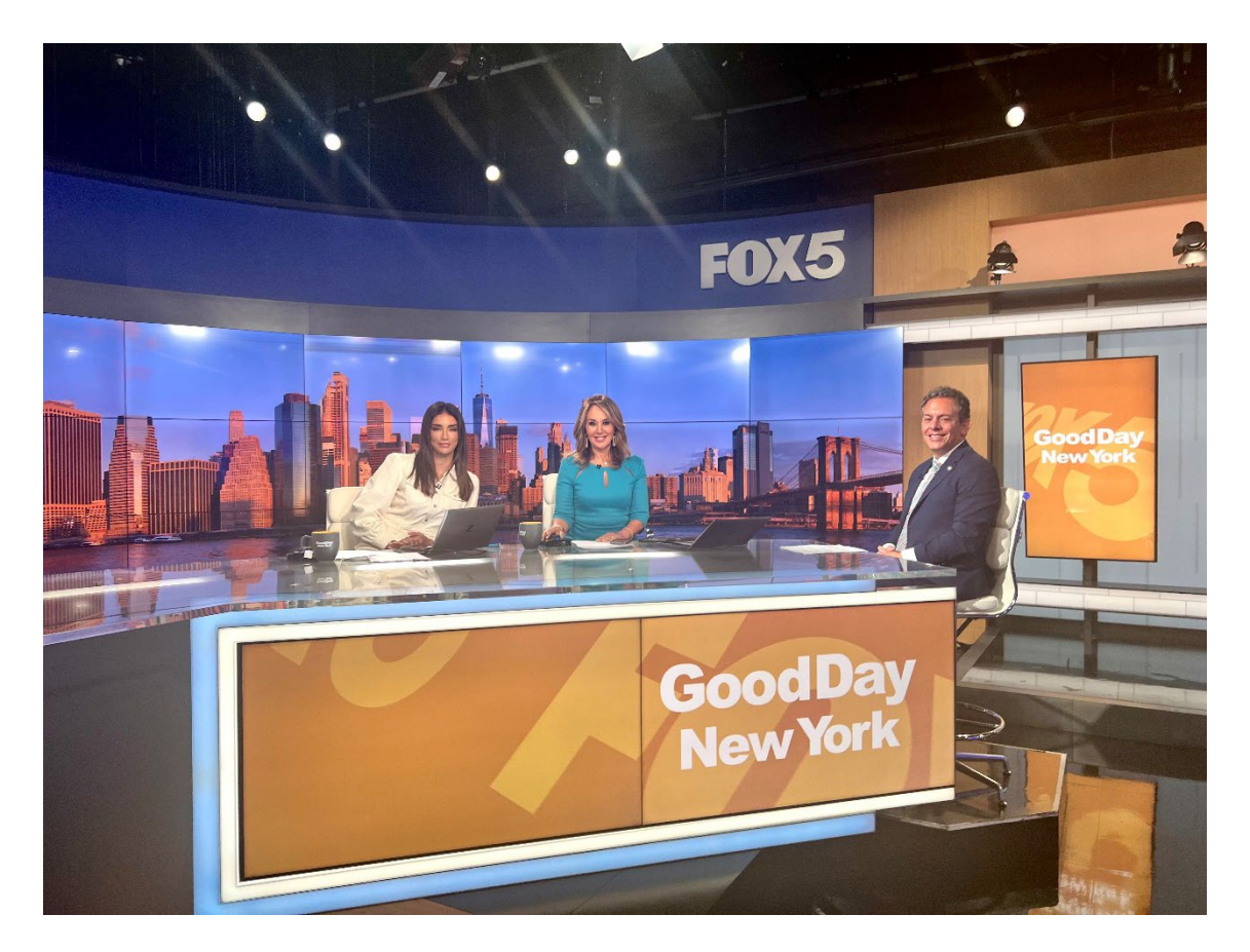
<u>I joined Good Day New York</u> to discuss the Commercial E-Bike Licensing Act, and making our streets safer for everyone!