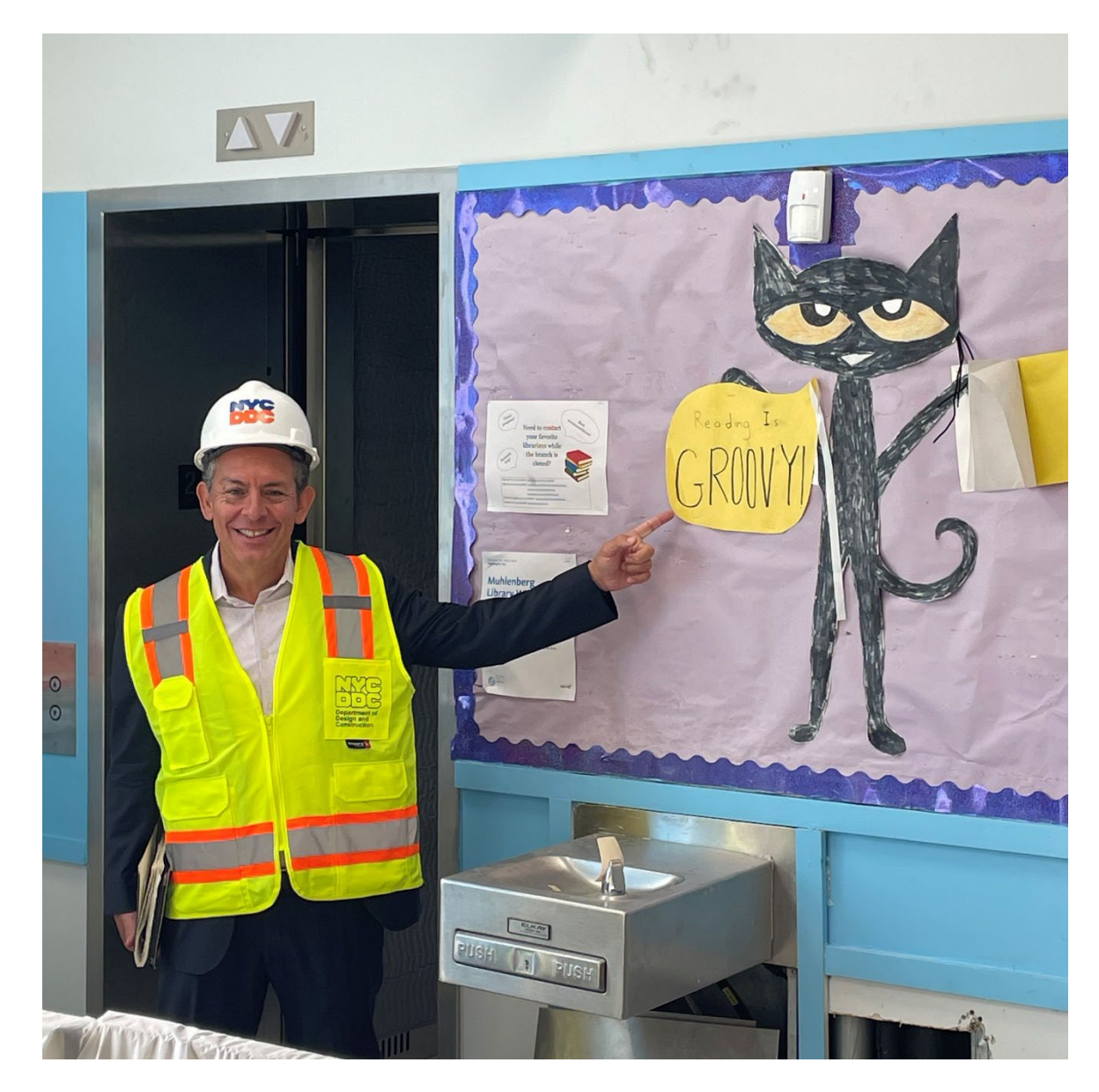
Surveying construction at Muhlenberg Library in Chelsea which is slated to reopen next year after HVAC improvements, elevator repairs, sidewalk improvements and a new fire alarm system.