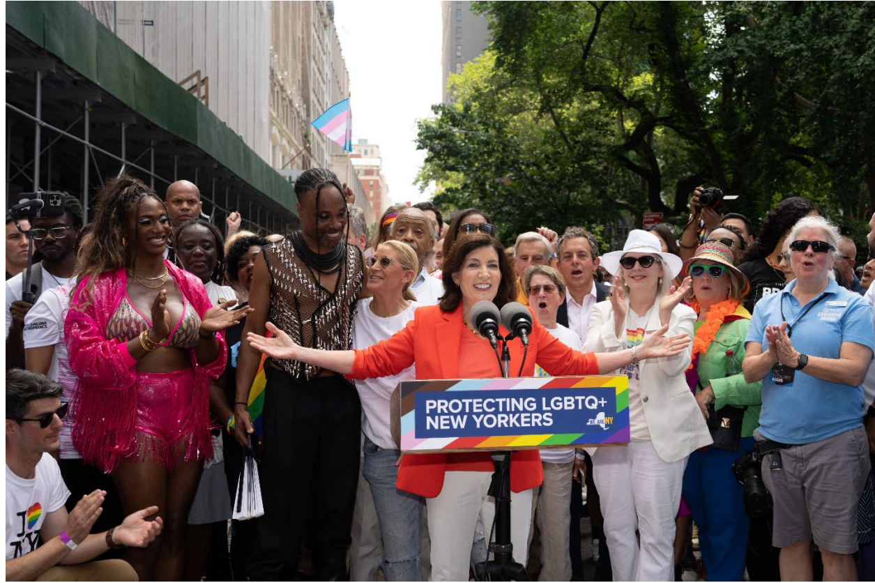
Governor Hochul after signing my legislation removing homophobic language from state law as well as the Transgender Safe Haven Act!