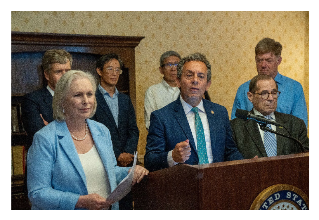
Speaking on the need for greater funding for people with severe mental illnesses at Fountain House in Hell's Kitchen with Senator Kirsten Gillibrand, Congressman Jerry Nadler and State Senator Brad Hoylman-Sigal.

problem by creating a new package of services under Medicaid specifically targeted to individuals living with SMI, setting a national standard for SMI care, and incentivizing states to provide intensive community-based services to treat SMI.