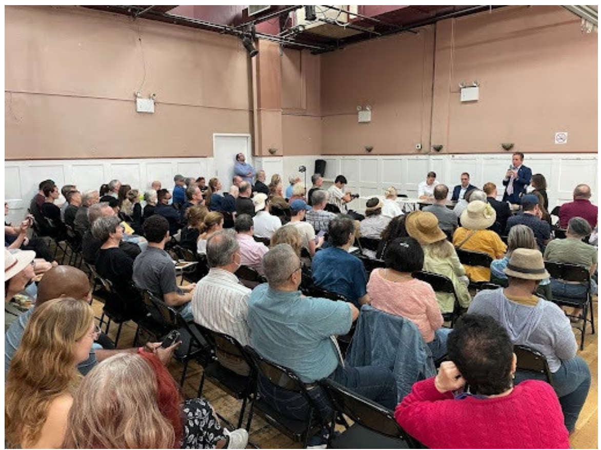
I held my first town hall meeting at Hartley House in Hell's Kitchen with over one hundred of our neighbors joining to discuss a wide range of issues.