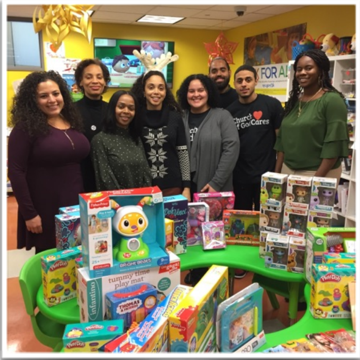
Assemblywoman Joyner along with the dedicated staff members from the PATH a city-wide intake center for homeless women