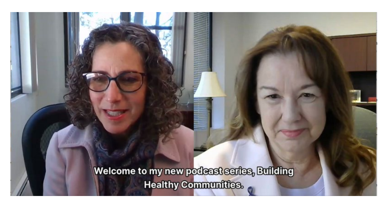
A screenshot from the first episode of my new podcast series, Building Healthy Communities.