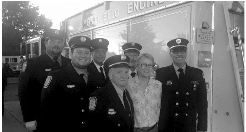
We are privileged to have such hard-working, dedicated volunteer firefighters protecting us.