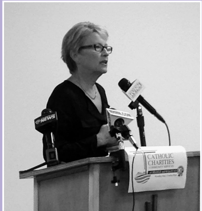
I had the opportunity to speak about mental health and substance abuse at Catholic Charities in Middletown.

More money in your pocket is good for you and it's good for our economy. Beginning in 2018, taxpayers will receive a tax cut of $270 million, increasing to $3 billion by 2025. We will have the lowest income tax rates in New York since World War II.