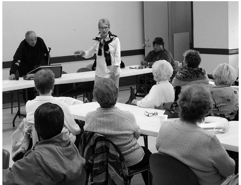
Each year, I visit each of our district's senior groups to give an update on my work in Albany and to listen to the concerns of our community's seniors.

If someone you know has passed away and was charged an early termination fee, you can call the Attorney General's office at 1-800-771-7755 or use the online complaint form found here: http://www.ag.ny.gov/complaint-forms