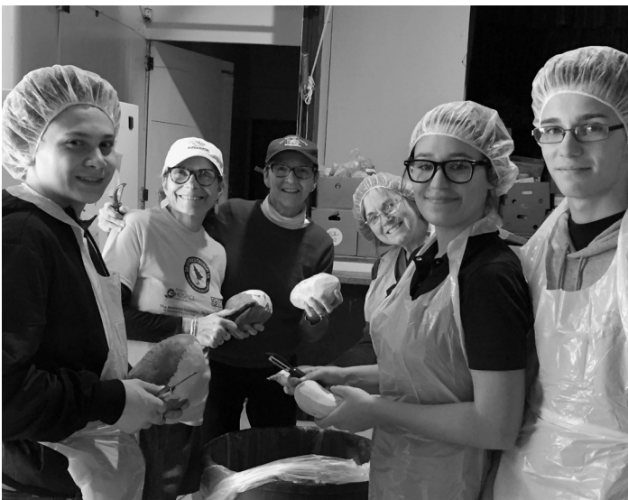
This year, we were lucky to have the help of students from Pine Bush High School with us as we prepared Thanksgiving dinner at the Federation for the Homeless.