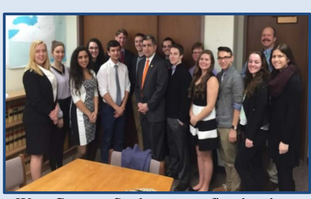
West Genesee Students got a first-hand experience in advocating for education funding during their recent trip to Albany.