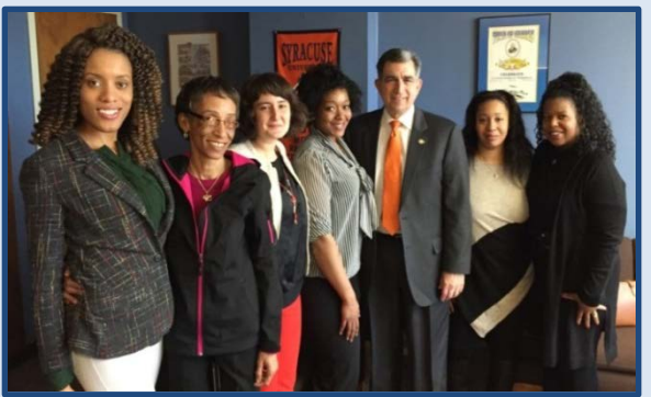
Members of Jubilee Homes visited Assemblyman Magnarelli's office in Albany to discuss revitalization of Syracuse's Southwest Neighborhood.