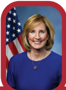
Congresswoman Claudia Tenney