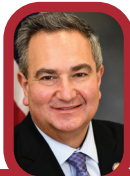
Senator George Borrello