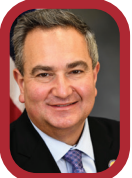
Senator George Borrello