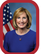
Congresswoman Claudia Tenney