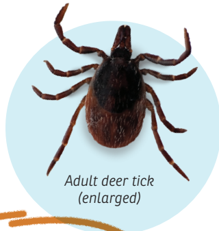
Adult deer tick (enlarged)

Lyme disease is a bacterial infection that can produce skin, arthritic, neurological and even cardiac symptoms. You can become infected through the bite of a deer tick that carries this bacteria. Not all deer ticks are infected, but avoiding tick bites and removing a tick as soon as you find it can reduce the likelihood of contracting Lyme disease or any other disease the tick may be carrying.