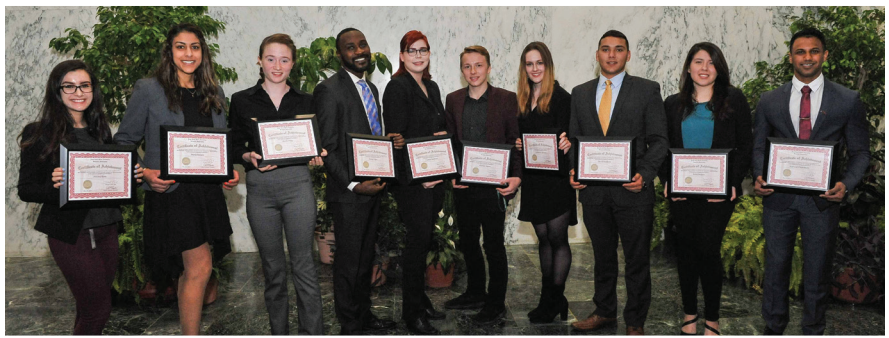
2017 Session Internship Research Paper Award Winners