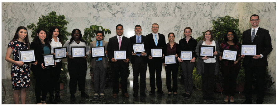
2017 Session Internship Mock Session Award Winners