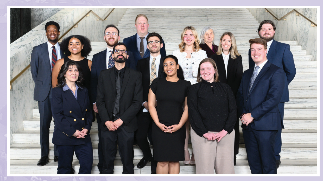
2024 Graduate Internship Class