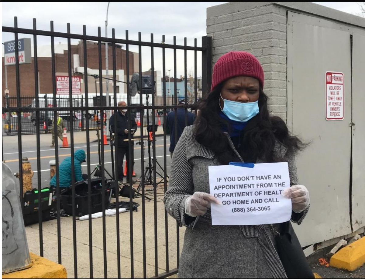
Assemblymember Rodneyse Bichotte visiting the COVID-19 testing site at Sears parking lot, holding up a sign informing people to call for an appointment before arriving