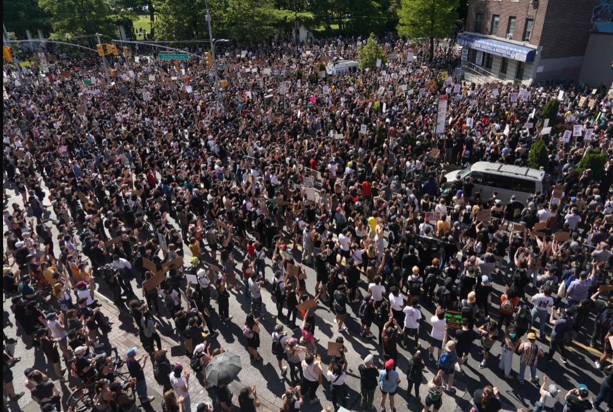
Protesters at Parkside Avenue and Ocean Avenue in Brooklyn.