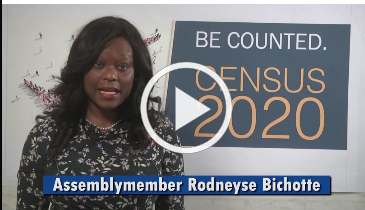
Assemblymember Rodneyse Bichotte

As we face unprecedented challenges in the fight against COVID-19, we must remember to complete the 2020 Census . The census asks just 10 simple questions that can be answered in just a few minutes online by visiting here or by calling 844-330-2020 .