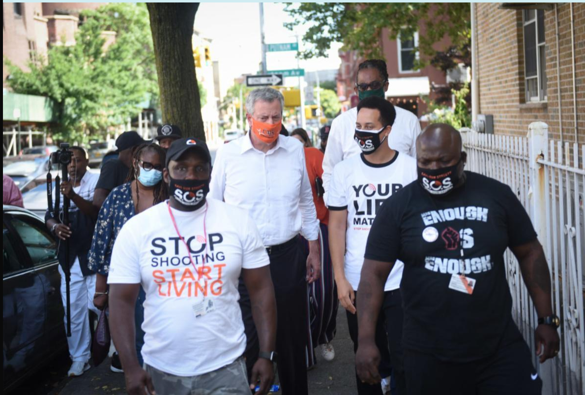
Photo Credit: Mayor Bill de Blasio; Michael Appleton/Mayoral Photography Office