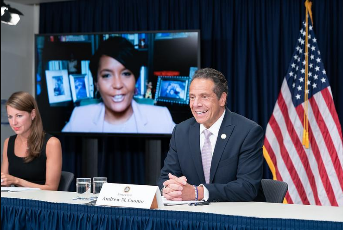
Governor Cuomo with Atlanta Mayor Keisha Lance Bottoms