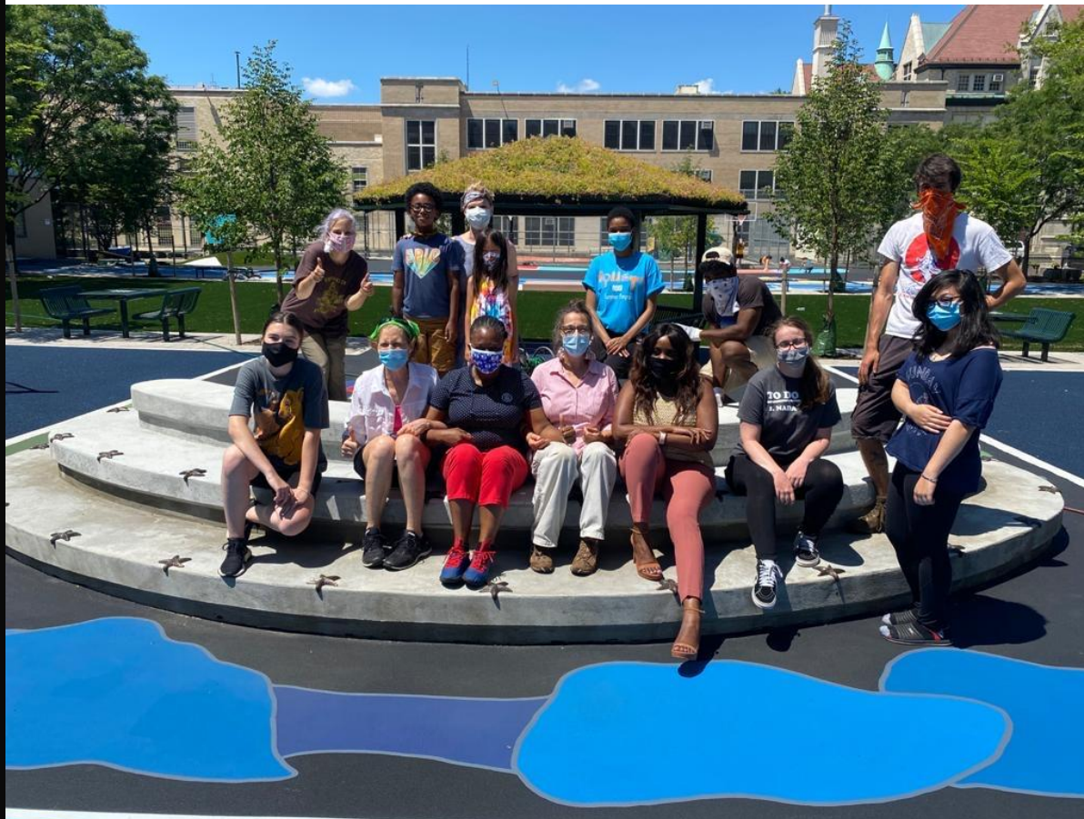
Community members with Assemblymember Rodneyse Bichotte and Councilmember Farah Louis.

Assemblymember Rodneyse Bichotte and Councilmember Farah Louis attended the P.S 152/315 playground garden planting day.