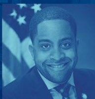
SENATOR ZELLNOR Y. MYRIE