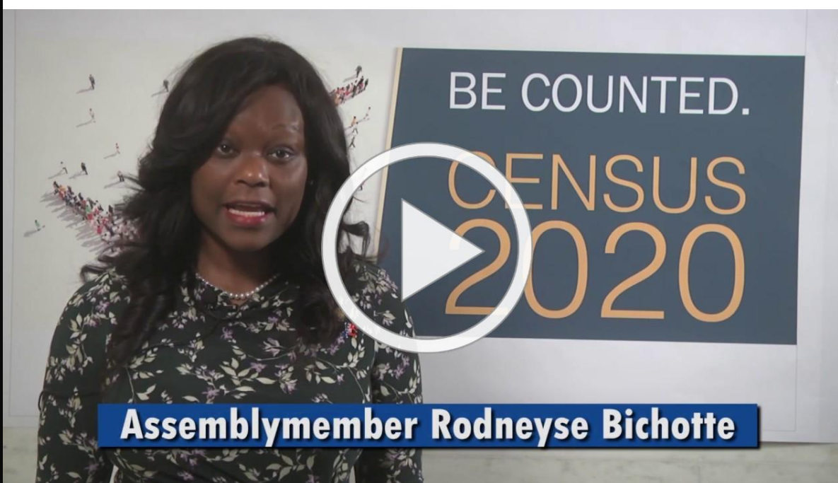
Assemblymember Rodneyse Bichotte

As we face unprecedented challenges in the fight against COVID-19, we must remember to complete the 2020 Census . The census asks just 10 simple questions that can be answered in just a few minutes online by visiting here or by calling 844-330-2020 .