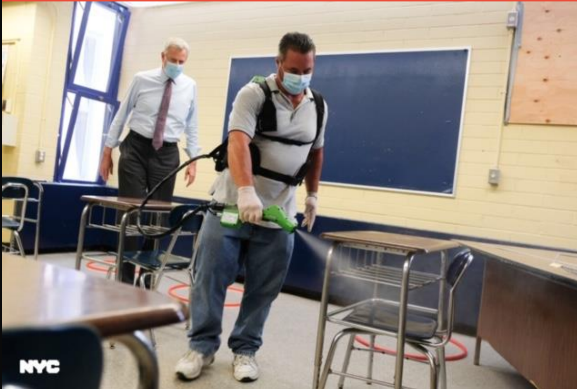
Custodial staff cleaning classroom with electrolyte cleaning.