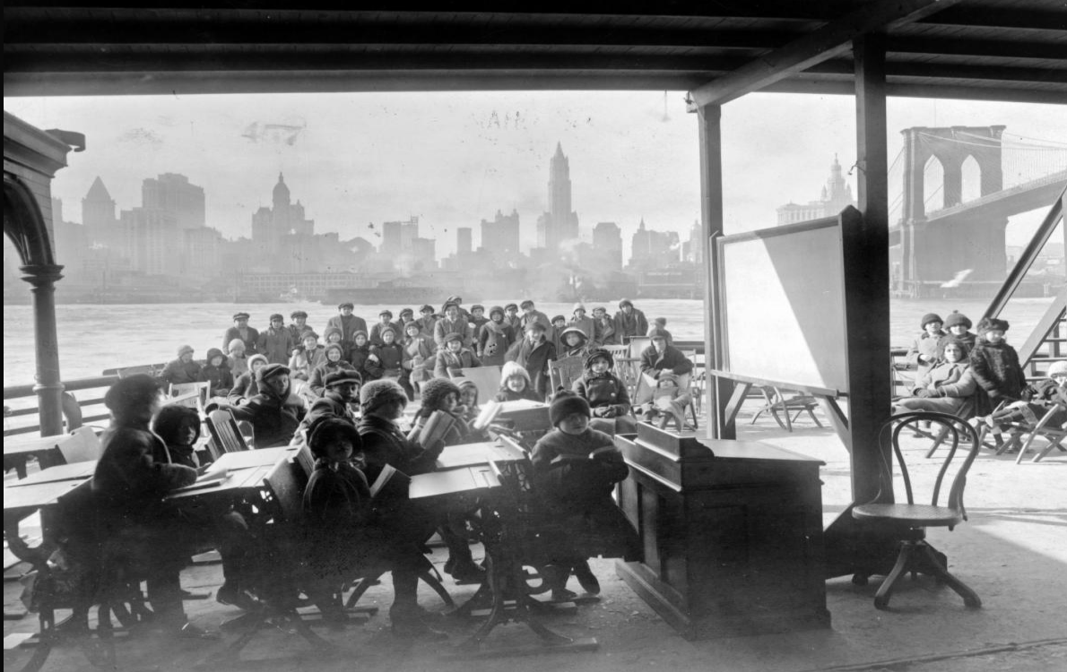
Photo Credit: Bureau of Charities, via Library of Congress. A classroom on a ferry in NYC circa 1915.