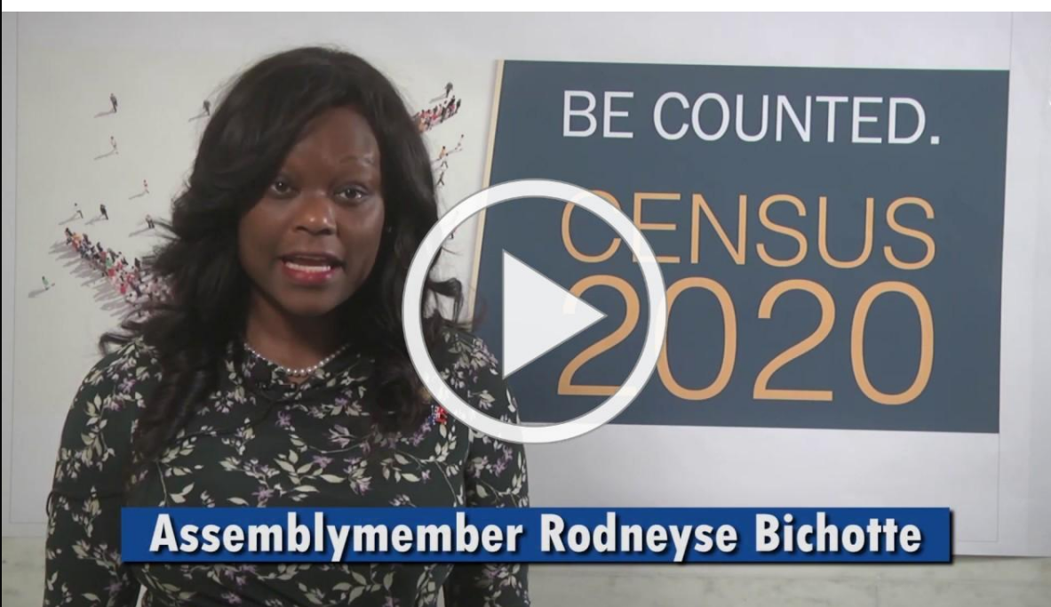
Assemblymember Rodneyse Bichotte

As we face unprecedented challenges in the fight against COVID-19, we must remember to complete the 2020 Census . The census asks just 10 simple questions that can be answered in just a few minutes online by visiting here or by calling 844-330-2020 .