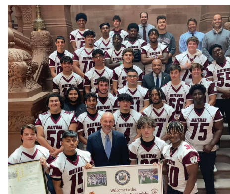
Great day welcoming the Suffolk County Champion Walt Whitman Wildcats Football Team to the state Capitol in Albany.