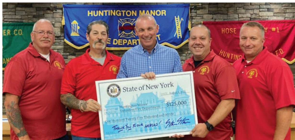
Presented a grant to our heroic volunteer firefighters for vital life-saving equipment.