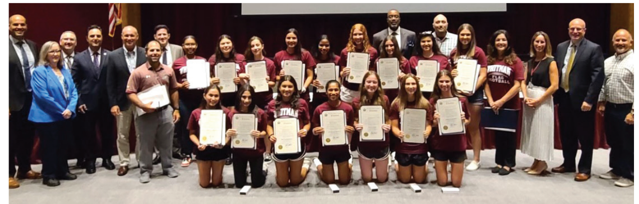
The Suffolk County Champion Walt Whitman Girls' Flag Football Team makes our entire South Huntington community proud.