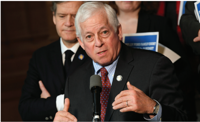
Assemblymember Lavine joins legislative colleague, and Chairman of the Senate Judiciary Committee, Brad Hoylman-Sigal, and other members of the Senate and Assembly, at a press conference in Albany on the critical issue of increasing the funding for our family courts. For Assemblymember Lavine, a key part of his role as Chairman of the Assembly Judiciary Committee is to ensure our courts are operating in a way which provides fairness and justice for all.