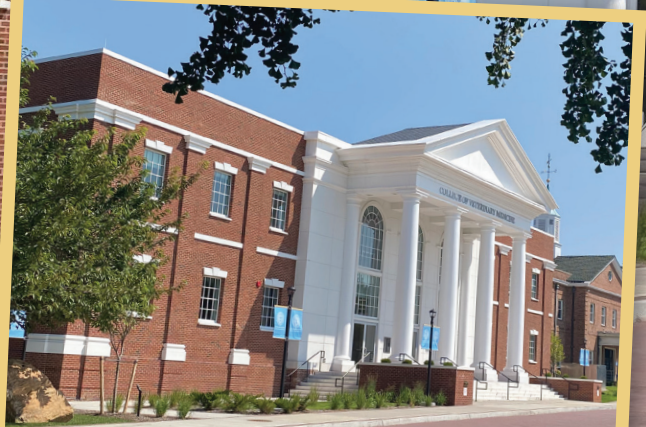
The new College of Veterinary Medicine Learning Center on the campus of Long Island University in Brookville.