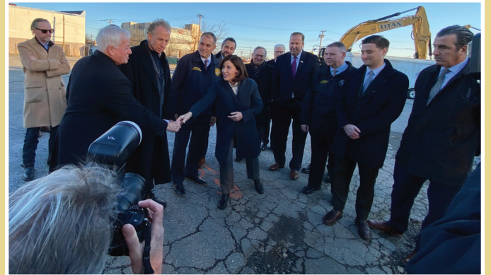
Governor Kathy Hochul lends her hand to Assemblymember Lavine at the groundbreaking for a 189-unit affordable housing development right in the heart of downtown Hicksville. The governor and her team continue to show how we can provide low-income residents with aesthetically designed yet affordable housing alternatives. This convenient location will provide residents with easy access to mass transit and nearby shopping options. It is a key step in the long-awaited revitalization of downtown Hicksville.