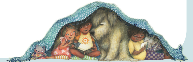
Stacey Pheffer Amato Member of Assembly