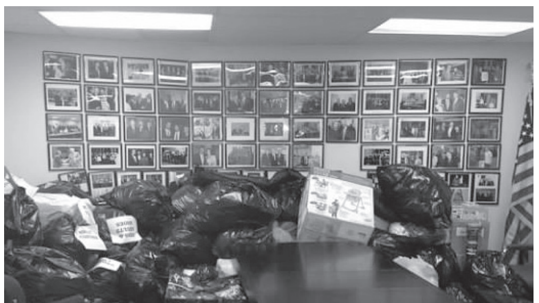
The donations for those affected by Hurricane Sandy nearly filled up our conference room in the days following the storm.

In the aftermath of Hurricane Sandy, Assemblyman Weprin and his staff coordinated a collection of items for those who lost nearly everything in the storm. We collected clothing, diapers, baby formula, toys, towels, flashlights, etc. We were overwhelmed by all the donations and thank everyone who participated. After the storm, our office coordinated with local agencies on incidents of power outages, flooding, and fallen trees on behalf of constituents. If your property suffered damage during the storm, or if you are still dealing with any other storm-related issue, please contact our office at weprind@assembly.state.ny.us to follow up.