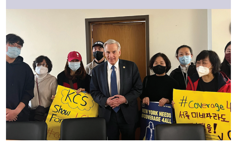
Meeting with constituents in the Legislative Office Building.

Many fantastic visitors come through our doors in Albany, and I'm always grateful to meet with the passionate advocates who help keep legislators like me informed on issues of concern. Representatives from Korean Community Services stopped by my office and shared many moving stories from their members. Too many New Yorkers struggle to make ends meet, which is why we need to pass the #Coverage4All Act. I am committed to fighting for the health of all New Yorkers – including the undocumented and uninsured.