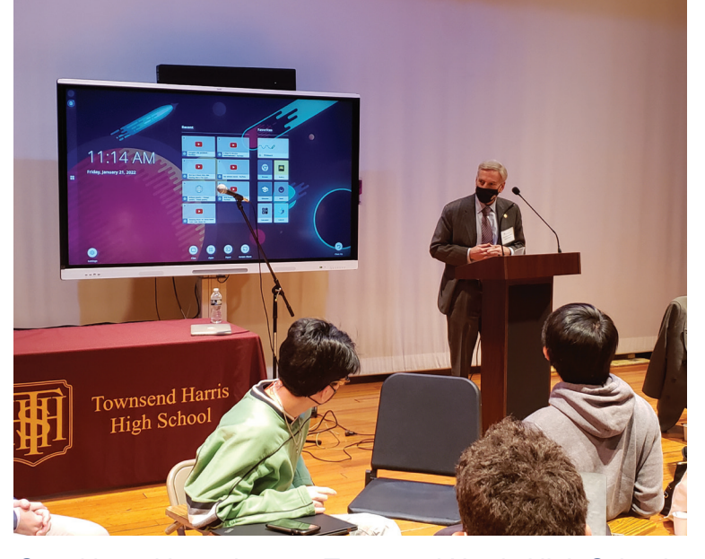
Speaking with students at Townsend Harris High School.

I had a great visit to Townsend Harris High School during their 2022 legislative breakfast, tour, and student roundtable. We were greeted by dozens of students who held group discussions for our edification on various literary works they had read. I was very impressed by the thoroughness and insightfulness of all the young scholars involved! It is always refreshing to meet with the next generation of leaders and I was pleased to answer questions about our state and local government.