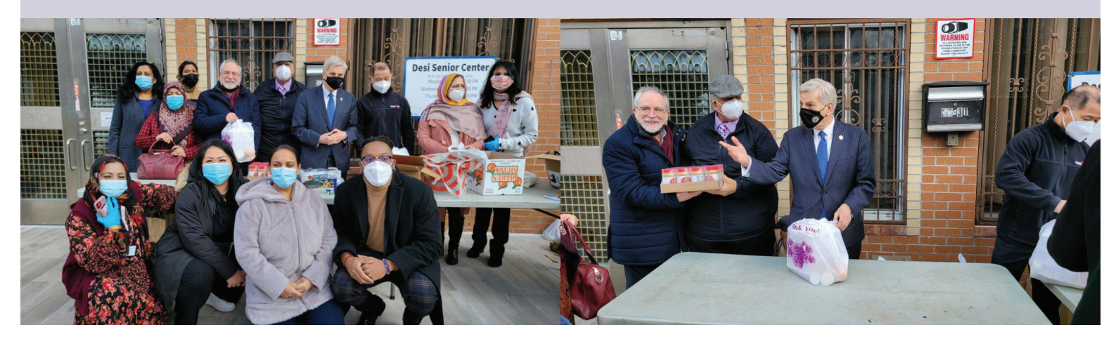
I gathered at the Jamaica Muslim Center in partnership with India Home, the Met Council, and members of the State Senate and Assembly.

Food insecurity is a problem across New York, and my office hosted a Can Drive with multiple elected and community partners across Eastern Queens to do our part in alleviating hunger. After weeks of collecting nonperishable items, we gathered at Jamaica Muslim Center to hand out cans and hot food that was provided by India Home. It is so important to give back to the community and help in a tangible way. Jamaica Muslim Center has graciously opened their doors to not only the Muslim community at large but to all who come to their doors.