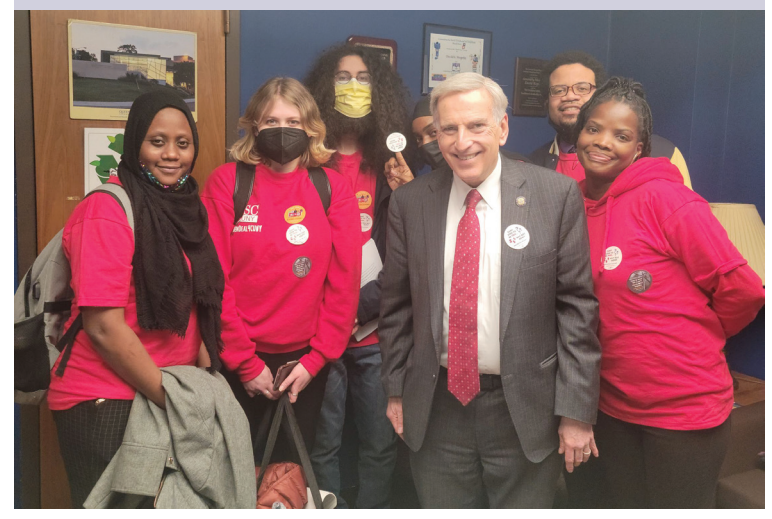
Visiting in the LOB with advocates for higher education.

The Legislative Office Building is always a center of activity during session, with activists and advocates for many different causes stopping by my office to chat. It is my policy that I will meet with anyone who wants to meet, and it was a pleasure to connect with representatives from my district who were fighting for greater investments in the City University of New York (CUNY) and the State University of New York (SUNY). I believe that our public colleges are a model for the rest of the country, and we made historic funding increases this year with investments including $60 million in state operating support funds for SUNY and $60 million for CUNY, as well as $159 million to hire additional full-time faculty at four-year colleges and community colleges. The Assembly Majority has long been dedicated to making college affordable. This budget also increases state support in operating revenue to raise the amount campuses receive for Excelsior Scholarship recipients by $13.7 million for SUNY state operated campuses, $2.1 million for SUNY community colleges and $2.8 for CUNY senior colleges, for a total of $18.6 million.