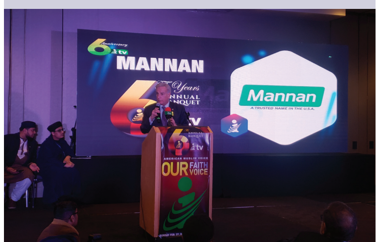
Speaking at the ITV6 Annual Banquet.

I attended the ITV USA 6th Anniversary Banquet as a "Guest of Honor" this year. ITV USA has served the Islamic community in the New York Metropolitan area for 6 years, and we came together to celebrate their message and to honor their successes. After giving remarks, I presented proclamations to the leadership at ITV USA, lauding their 24/7 outreach to over 2 million viewers. This was a wonderful night of cultural sharing and I look forward to seeing ITV USA grow in the years to come.