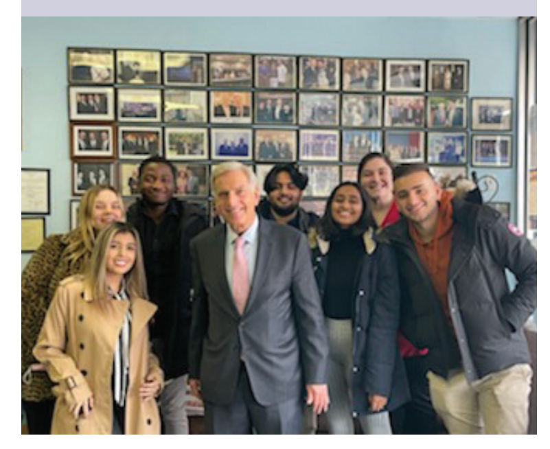
Welcoming a delegation of St. John's University students to my District Office in Fresh Meadows.

It was a pleasure to welcome a delegation of students from St. John's University to my Fresh Meadows District Office. These committed young folks briefed my staff and me about a bill that is up for consideration this session and I gave them advice on best practices to push this legislation toward passage. One of the most rewarding parts of my role as Assemblyman is the opportunity to meet with the leaders of tomorrow!