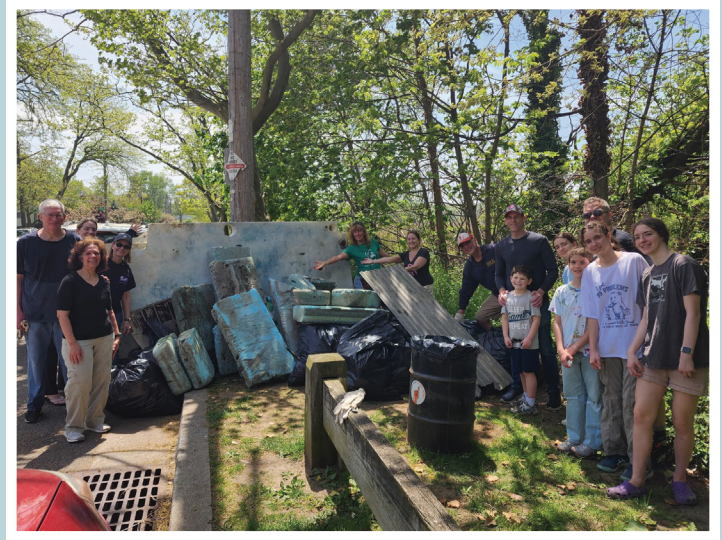
Assemblyman Braunstein lent a hand with volunteers at the Udalls Cove Preservation Committee's 56th Annual Cleanup to help support the health and beauty of the local wetlands.