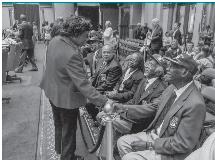
Assemblymember Cook welcomes four Tuskegee Airmen to the State Capitol in honor of the group’s 75th Anniversary.