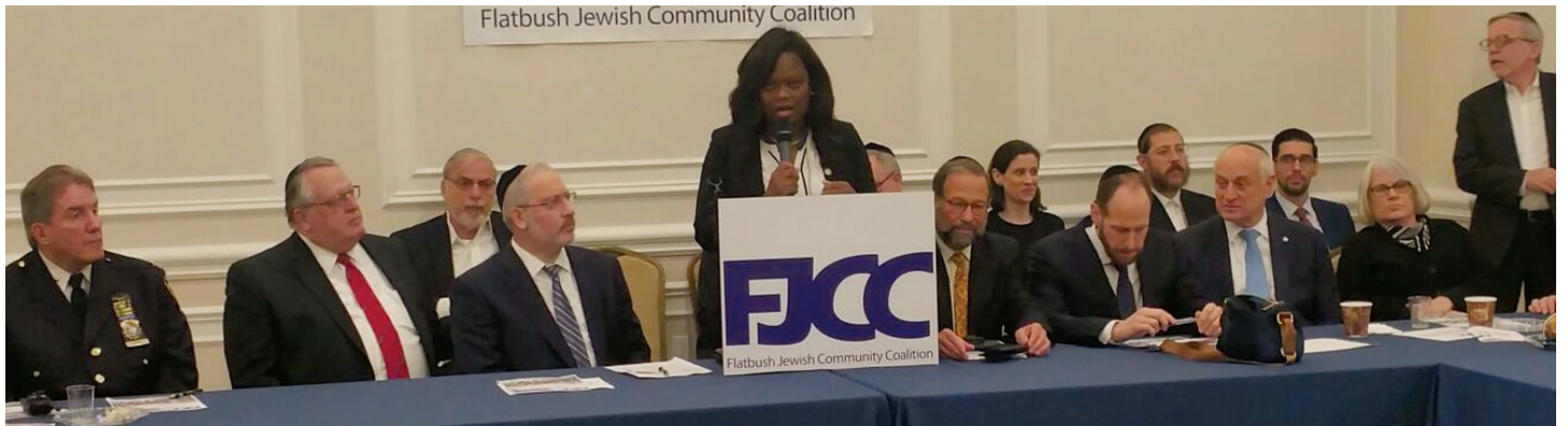
Assemblymember Rodneyse Bichotte addresses key issues at the Flatbush Jewish Community Coalition Legislative Breakfast.