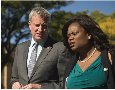
Assemblymember Bichotte with Mayor Bill de Blasio outside the Young Israel of Avenue K discussing potential solutions for issues affecting the district.