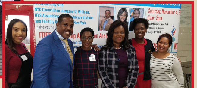
Assemblymember Bichotte with Senator Kevin Parker supporting CUNY Citizenship Now! Immigration Forum at the Flatbush YMCA.