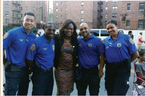
Assemblymember Rodneyse Bichotte supporting NYPD officers from the 67th Precinct during their National Night Out.