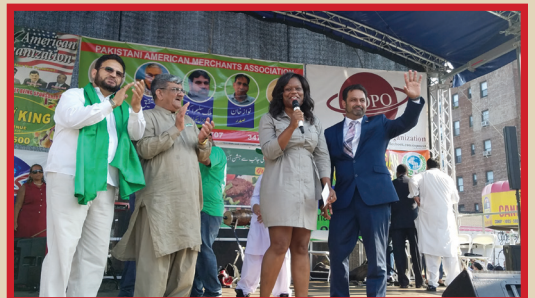
Assemblymember Bichotte addresses the crowd during 2017 Pakistan Independence Day Celebration.