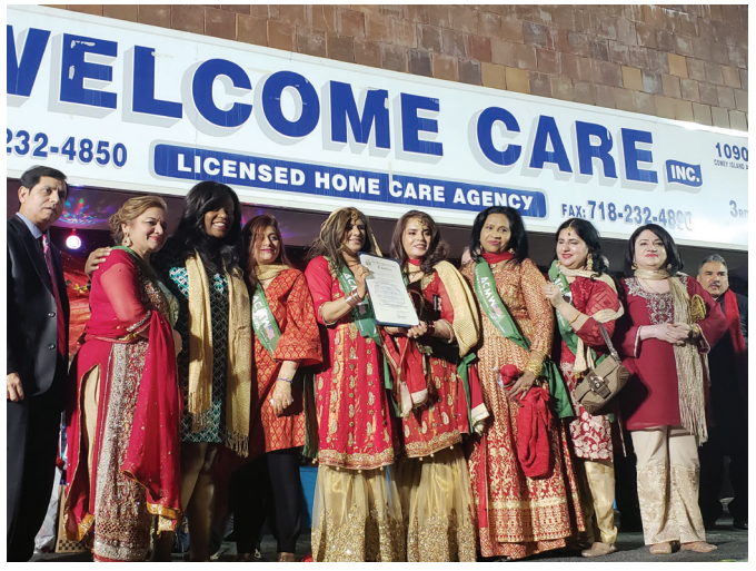
Assemblymember Rodneyse Bichotte honoring Bazah Roohi and the American Council of Minority Women for their 10th Annual Chand Raat Bazaar and celebration of Eid Mubarak.

Assemblymember Rodneyse Bichotte joins Mayor Bill de Blasio and others at a rally urging speed cameras in school zones to protect our children.