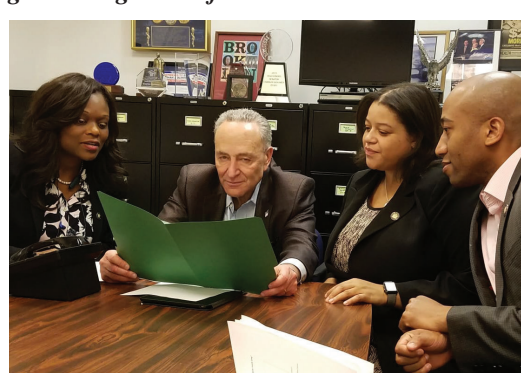
Assemblymember Rodneyse Bichotte, along with Assemblymembers Michaelle Solages, and Clyde Vanel meeting with U.S. Senator Chuck Schumer.