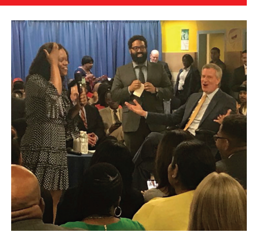
Assemblymember Rodneyse Bichotte with NYC Mayor Bill de Blasio during a townhall at PS 6 in Flatbush, Brooklyn.