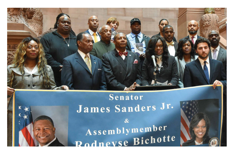
Assemblymember Rodneyse Bichotte with Senator James Sanders, Jr., elected officials and members of the MWBE Coalition during MWBE Coalition Day 2018.