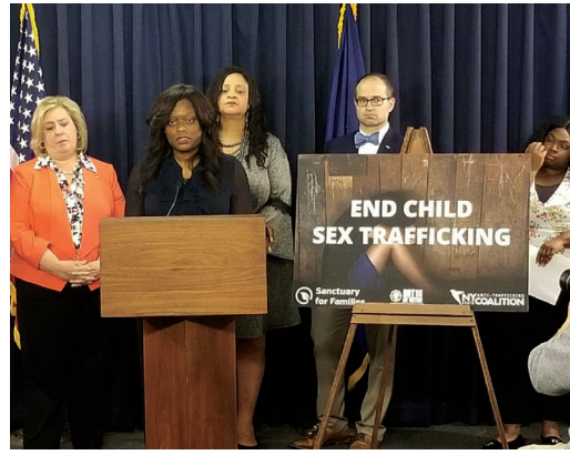
Assemblymember Rodneyse Bichotte calling for the end of child sex trafficking at a Sanctuary for Families press conference.