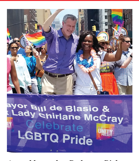
Assemblymember Rodneyse Bichotte with NYC Mayor Bill de Blasio during the NYC Pride Parade 2018.