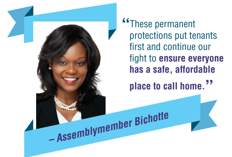
- Assemblymember Bichotte