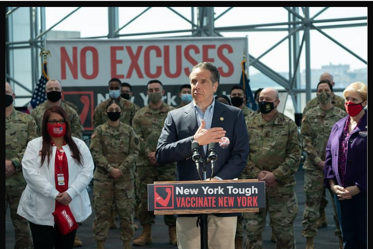
Governor Cuomo Announces Statewide Launch of "Vaccinate NY" Campaign and Encourages All New Yorkers to Schedule an Appointment.