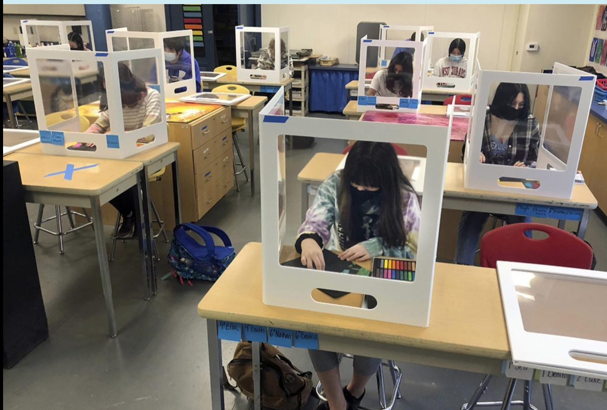
Returning children to the classroom safely is as much of a policy challenge for the Biden White House as it is a political hurdle.