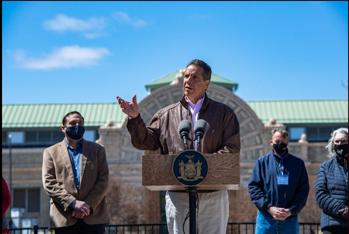
Geddes, NY- Governor Andrew Cuomo announces New York State Fairground events, including The Great NYS Fair will take place with reduction in attendance.