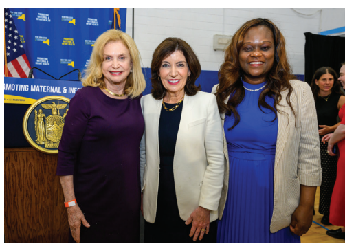
Assemblymember Rodneyse Bichotte Hermelyn speaking at Governor Kathy Hochul's introduction of a Six-Point-Policy to address the maternal mortality and morbidity crisis (enacted in the NYS Budget) at Wyckoff Medical Center in Brooklyn.