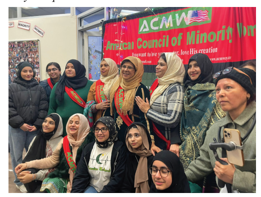
Assemblymember Rodneyse Bichotte Hermelyn joined the American Council of Minority Women for a Ramadan food distribution.