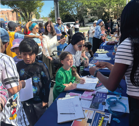
Children and parents retrieving free resources at a co-sponsored annual Back to School Backpack Giveaway in partnership with Plaza Auto Mall.