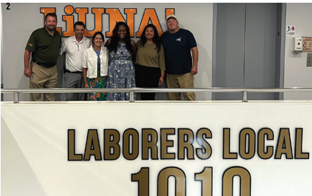
Assemblymember Rodneyse Bichotte Hermelyn recently visited Laborers-Employers Cooperation and Education Trust (LECET) Local 1010 for a site tour to learn more about their programs. LECET 1010 plays a key role in connecting labor and management to promote good jobs, workforce training, and infrastructure development that strengthens New York's communities.