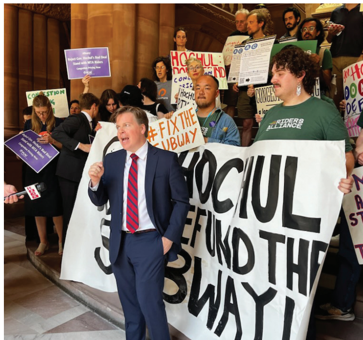
Assemblymember Carroll speaking at a rally in Albany in favor of congestion pricing going into effect and in opposition to the Governor's last-minute cancellation of the program, which was due to go into effect on June 30th.

My office received hundreds of calls expressing opposition to the Governor's announcement and voicing support for the implementation of congestion pricing. Delaying congestion pricing means New Yorkers will not only lose the benefits of reduced traffic but also jeopardizes many essential MTA projects to modernize and improve our subways, buses, and commuter rails; these range from signal upgrades, to making trains run more efficiently to improving access for disabled riders at stations throughout the system. I will continue to advocate for the program's implementation and I am appreciative of the words of support I received from so many constituents.