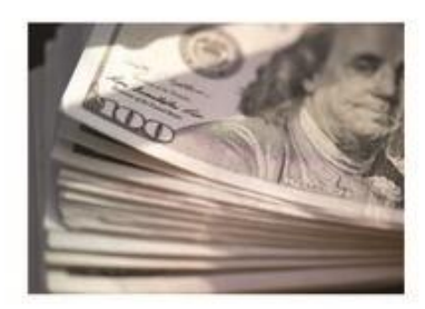
UNCLAIMED FUNDS WITH THE NYS COMPTROLLER From 10am to 12:30pm

Meet the Crime Prevention Officers from the 72<sup>nd</sup> and 78<sup>th</sup> Precincts and hear how you can better safeguard your property and ensure your personal safety and security as warmer weather approaches.