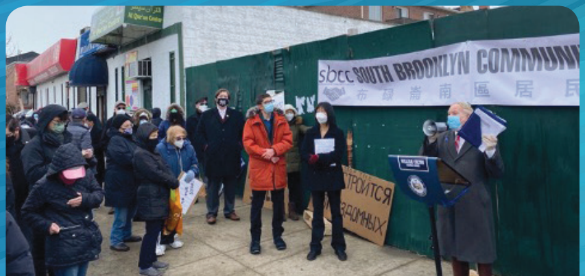
Assemblyman Colton, alongside his District Leader, Nancy Tong, held a press conference at 2147 Bath Avenue, Brooklyn, with many of the community supporters to voice their oppositions of building this homeless shelter.

Assemblyman Colton demands that the City must create more affordable housing instead of building transient hotels for the homeless. For those who need mental hygiene or addiction services such treatment centers must be in non-residential areas. Building more homeless shelters is not the solution. It is essential that we oppose the building of the homeless shelter on 2147 Bath Avenue.