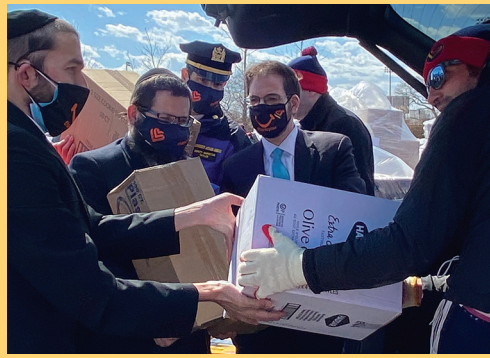
Assemblyman Eichenstein volunteers at the Chasdei Lev Passover Food Distribution.