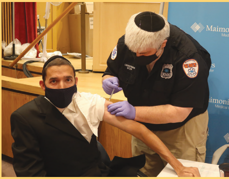
Assemblyman Eichenstein does his part to help stop the spread of COVID-19 by getting vaccinated!