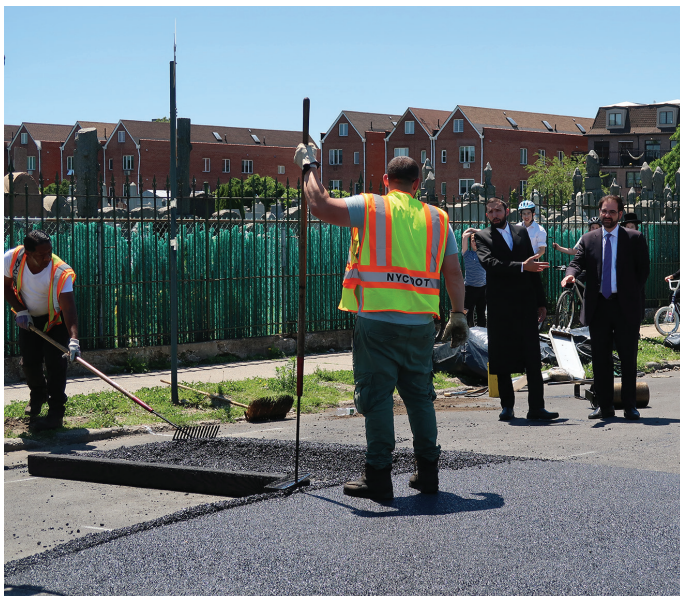
Assemblyman Simcha Eichenstein and Councilman Kalman Yeger on site during installation of the speed bumps.

When repaving the length of 21st Avenue last year, the NYC Department of Transportation removed speed bumps that had been in place for many years. This caused hazardous conditions for pedestrians and motorists as speeding cars became a common occurrence.