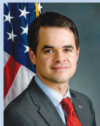
Senator DAVID CARLUCCI

Observe the passage of Dyslexia Day Resolutions in the Assembly and Senate!