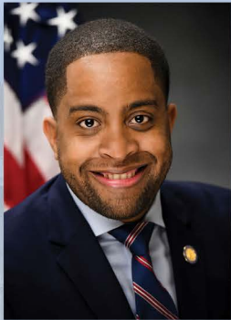
Senator ZELNOR MYRIE