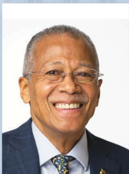
Senator ROBERT JACKSON