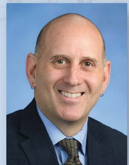
Assemblymember HARVEY EPSTEIN