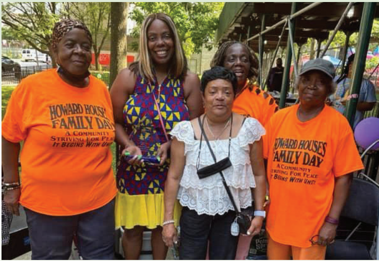
Family Days and block parties are so much fun in the summer.