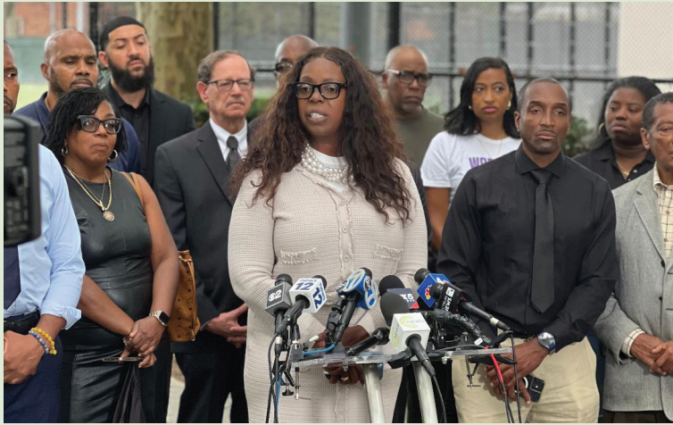
Assemblywoman Walker demanded answers after a shooting at the Sutter Avenue L train station left four people hit by police bullets, including a man who suffered a traumatic brain injury.