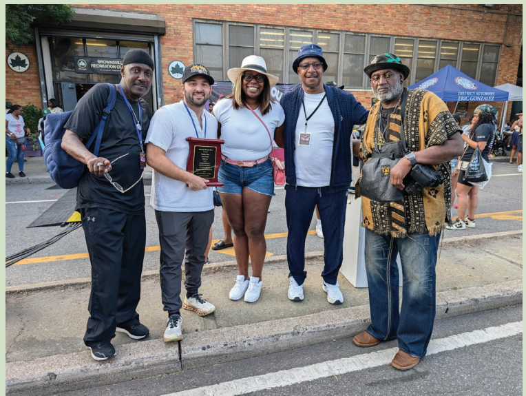
It's always great to catch up with friends and make new ones at the Old Timers' Day Reunion.