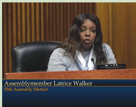
Assemblymember Latrice Walker 55th Assembly District