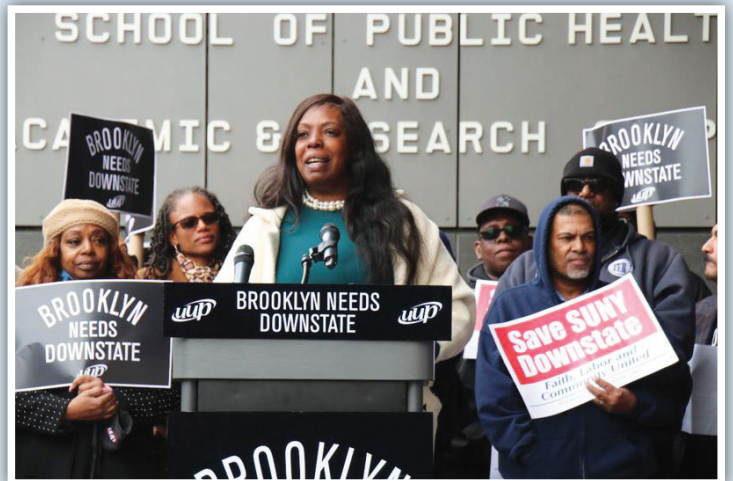
Latrice Monique Walker Assemblywoman, 55th A.D.