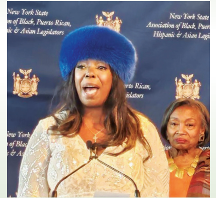
Thank you to everyone who attended the 53rd Annual Legislative Conference in Albany in February, including folks who traveled from the district on buses.